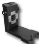
360° Laser Bracket (48-35-1311)