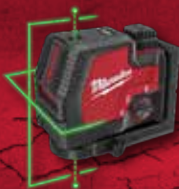
USB Rechargeable Green Cross Line & Plumb Points Laser (3522-21)