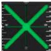
Responsive Laser Alignment Target (48-35-1111)