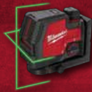
USB Rechargeable Green Cross Line Laser (3521-21)