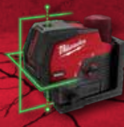
M12™ Green Cross Line and Plumb Points Laser (3622-20)