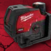
M12™ Green Cross Line & Plumb Points Laser Kit (3622-21)