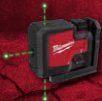
USB Rechargeable Green 3-Point Laser (3510-21)